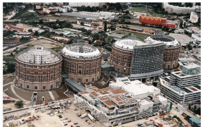
Figure 1. Conversion of gas storage facilities into a multifunctional space in Vienna