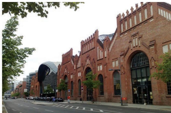
Figure 2. Industrial complex Am Borsigturm in Berlin after renovation