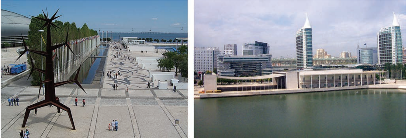
Figure 3. Lisbon based industrial brownfield transforms into the Park of Nations

Prior to the renewal this complex belonged to the brownfield category B, and so the participation of the private sector had to be partly backed by public sector. Good transport accessibility of the site is enabled by direct links to motorway, railway and metro lines.